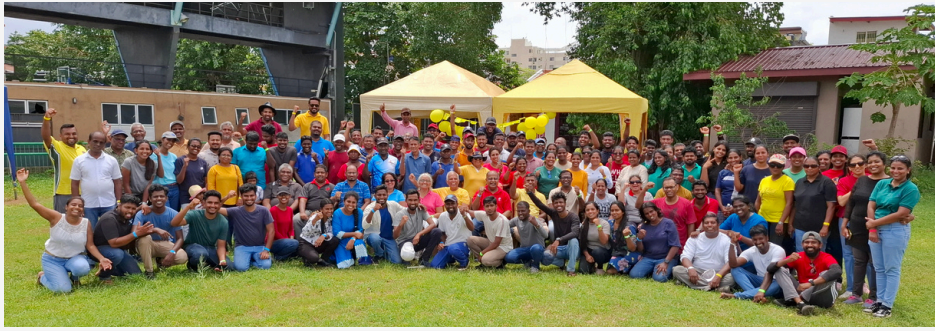
Colombo Theological Seminary added 33 photos and a video to the album Community Celebration Day: 7th June. June 18, 2024