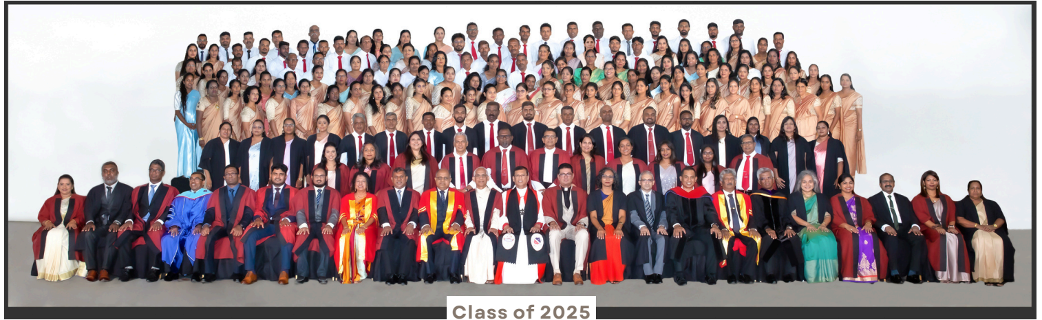
Class of 2025